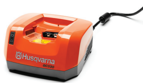
HUSQVARNA CHARGER QC330 967 09 14-02