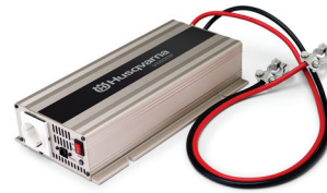
HUSQVARNA INVERTER VI600F 967 62 85-01