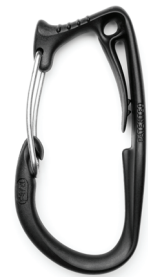
CHAIN SAW HOOK 580 80 03-01