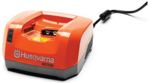
HUSQVARNA CHARGER QC330 967 09 14-04