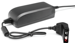
HUSQVARNA BATTERY CHARGER 967 33 56-71