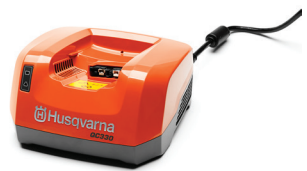
HUSQVARNA CHARGER QC330 967 09 14-03