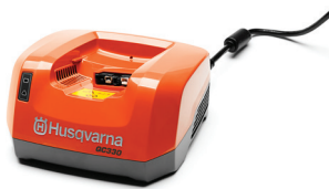
HUSQVARNA CHARGER QC330 967 09 14-01