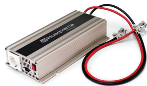
HUSQVARNA INVERTER VI600F 967 62 85-04