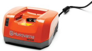
HUSQVARNA CHARGER QC330 967 09 14-05