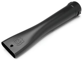
NOZZLE 579 79 75-01