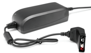
HUSQVARNA CHARGER QC80 967 33 56-51