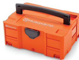
HUSQVARNA BATTERY BOX S 585 42 87-01