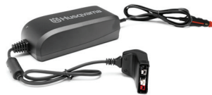
HUSQVARNA CHARGER QC80F 967 62 83-01