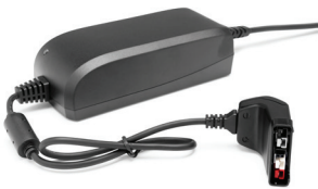
HUSQVARNA CHARGER QC80 967 33 56-31