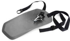
HIP PAD 587 83 40-01