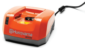
HUSQVARNA CHARGER QC330 967 09 14-06