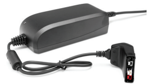
HUSQVARNA CHARGER QC80 967 33 56-61