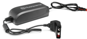
HUSQVARNA CHARGER QC500 967 09 15-06