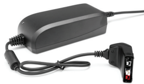
HUSQVARNA CHARGER QC80 967 33 56-41