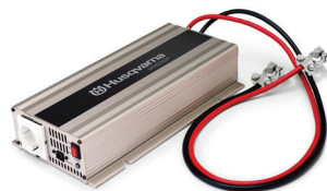
HUSQVARNA INVERTER VI600F 967 62 85-01