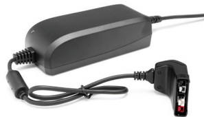
HUSQVARNA CHARGER QC80 967 33 56-51