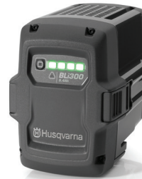
HUSQVARNA BATTERY BLI300 967 07 19-01