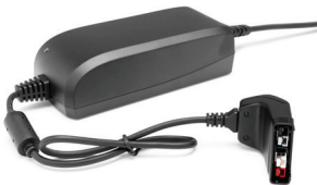
HUSQVARNA CHARGER QC80 967 33 56-41