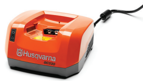
HUSQVARNA CHARGER QC330 967 09 14-03