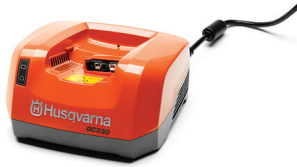
HUSQVARNA CHARGER QC330 967 09 14-02