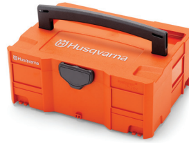
HUSQVARNA BATTERY BOX S 585 42 87-01