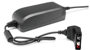
HUSQVARNA BATTERY CHARGER 967 33 56-71