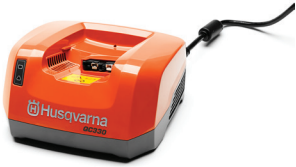
HUSQVARNA CHARGER QC330 967 09 14-01