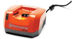
HUSQVARNA CHARGER QC330 967 09 14-04