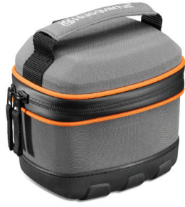
HUSQVARNA BATTERY BAG 585 37 18-01