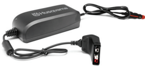
HUSQVARNA CHARGER QC80F 967 62 83-01