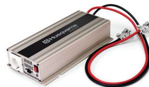
HUSQVARNA INVERTER VI600F 967 62 85-02