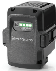
HUSQVARNA BATTERY BLI200 967 09 19-01