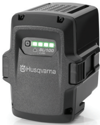
HUSQVARNA BATTERY BLI100 967 09 18-01