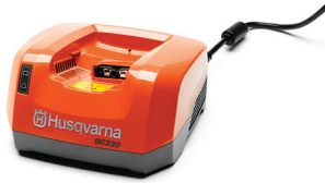
HUSQVARNA CHARGER QC330 967 09 14-06