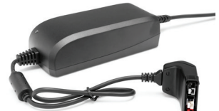
HUSQVARNA CHARGER QC80 967 33 56-31