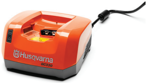
HUSQVARNA CHARGER QC330 967 09 14-05