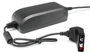
HUSQVARNA CHARGER QC80 967 33 56-61