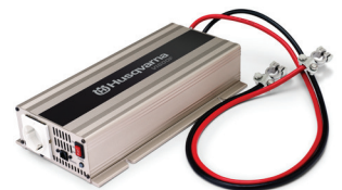
HUSQVARNA INVERTER VI600F 967 62 85-03